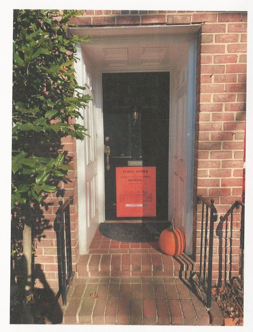
Photograph No. 2